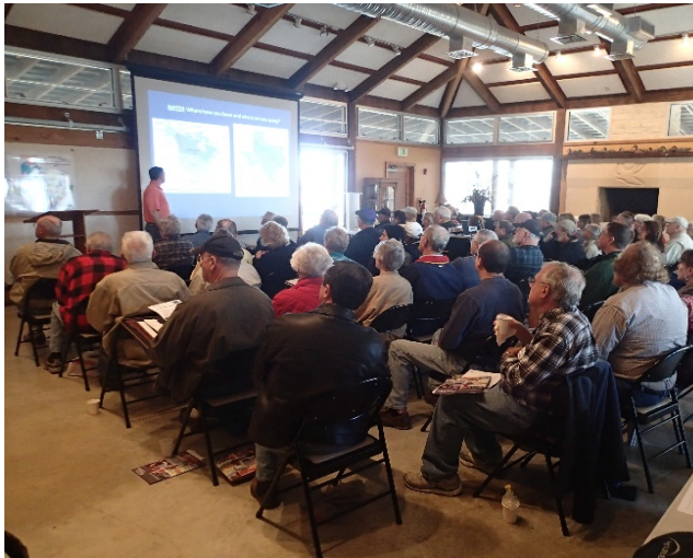
Texas A&M AgriLife Extension Service staff deliver a presentation at a Texas Well Owner Network educational event.

During 2019 and the first half of 2020, the TGPC continued its sponsorship of exhibitor booths and displays at 11 Austin-area conferences, seminars, and meetings with an estimated 3,784 visitors (estimated as ten percent of registered attendees). From its exhibitor booth, the TGPC distributed its trifold brochure, hydrogeological maps, fact sheets, booklets, and links to downloadable groundwater publications at TGPC and other websites. In March of 2019 and 2020, a TGPC-sponsored poster for National Groundwater Awareness Week was displayed in a dozen central Texas locations, including the Texas Capitol.