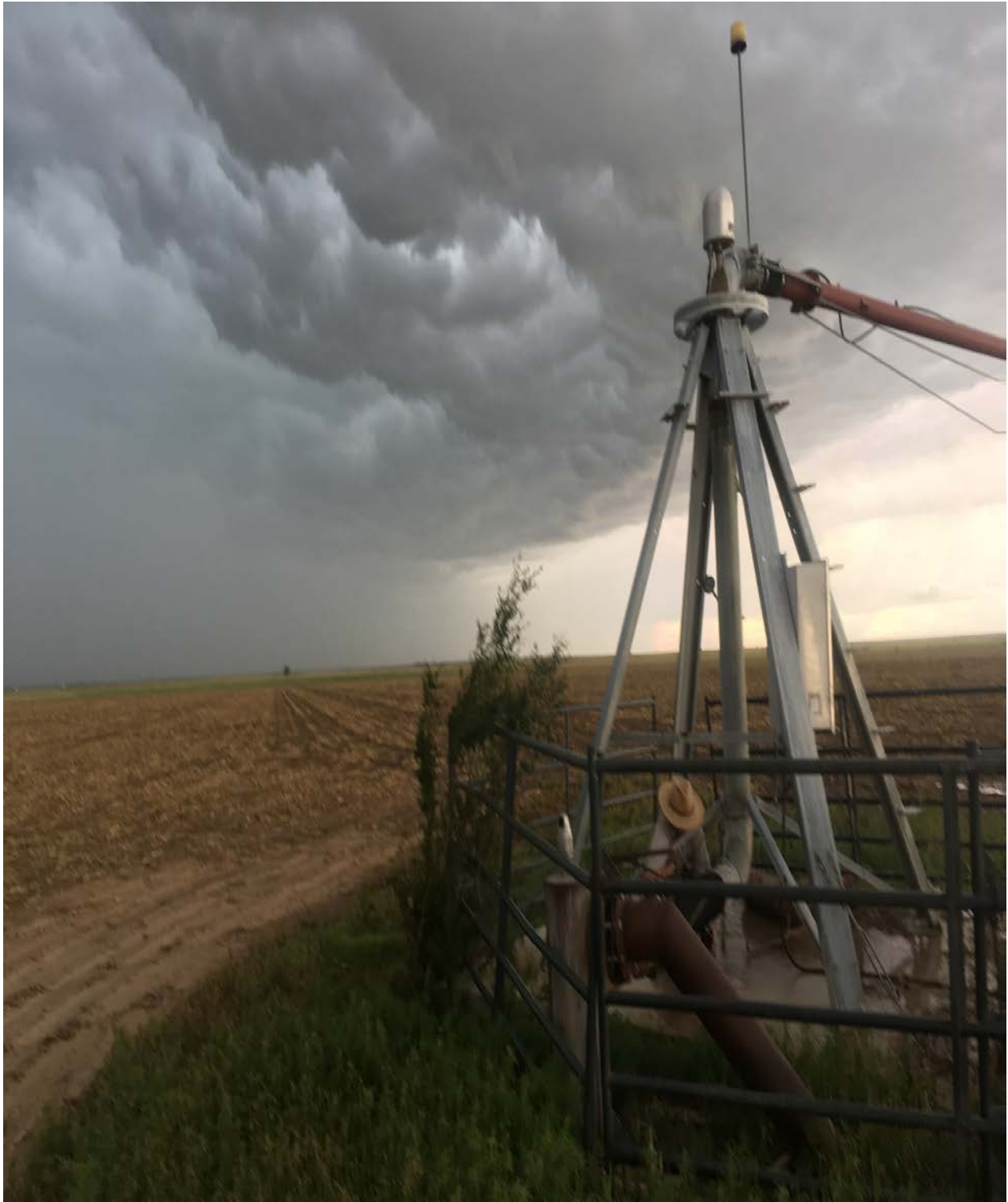
Plenty of rain in the Panhandle during 2019. TCEQ geologist Scott Underwood collects a groundwater sample for pesticide analysis from a center pivot located north of Texline, Texas, June 2019.