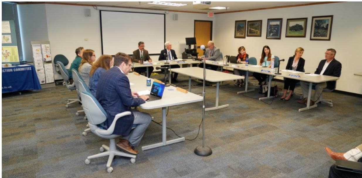
Texas Groundwater Protection Committee Quarterly Meeting in Austin, Texas, October 2019.

Periodically, state laws are enacted that require the TGPC to undertake rulemaking. Much of the TGPC's work is performed in quarterly meetings and through the efforts of its subcommittees.